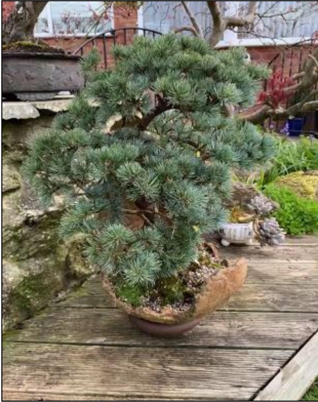
Blue Atlas Cedar

From Roger we saw an impressive array of trees this month which included a -