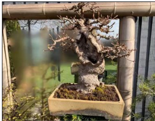
Hollow Trunk Field Maple